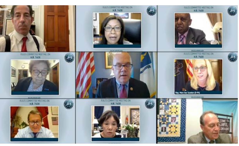
Chairman McGovern remotely chairs a Rules Committee meeting September 30, 2020.